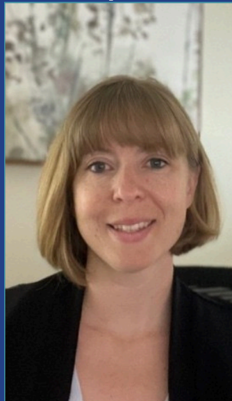
Idaho Office of the Attorney General