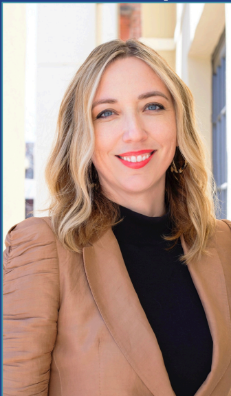
Deputy Director of Idaho Legal Aid