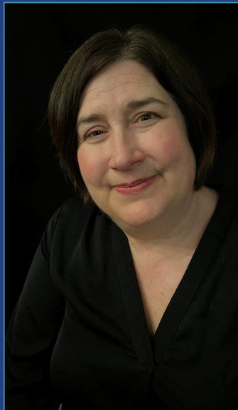
Idaho Better Business Bureau